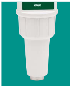
Magnetic base included