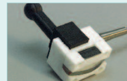
861616 surface probe