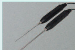
881603 immersion probe