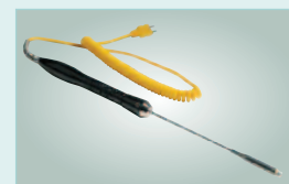
881602 surface probe